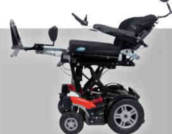
Lift with extension